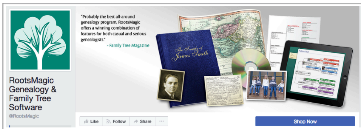
RootsMagic page on Facebook

When a shaking leaf or tip sends you to another user's tree, use the archive's internal messaging options to introduce yourself. You can then compare notes, ask questions and discuss research options. Both Ancestry and MyHeritage offer impressive networking features.